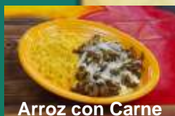
Arroz con Carne

Grilled chicken, onions, bell peppers, tomatoes covered w/ cheese sauce. Served with rice, refried beans & tortillas.