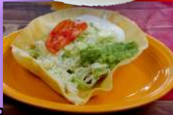
Bob's Special Lunch