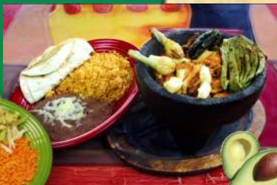
Pollo con Cilantro

Grilled chicken, steak and chorizo sauteed with canbray onions with a dip of fried jalapeno with special spice sauce garnished with cactus, cambray onions, slice of Chihuahua cheese. Served with rice, beans and tortillas.