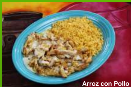
Arroz con Pollo